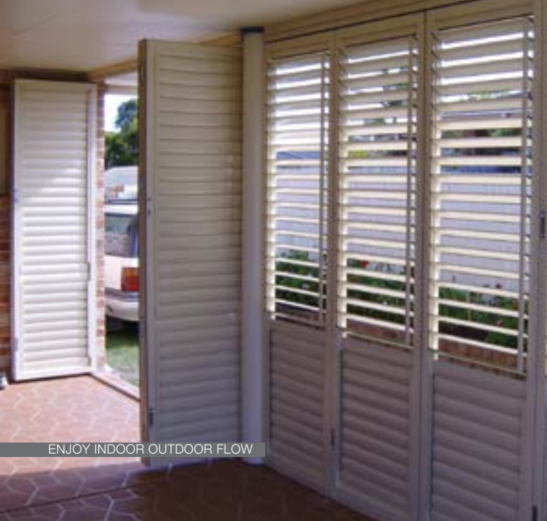
ENJOY INDOOR OUTDOOR FLOW