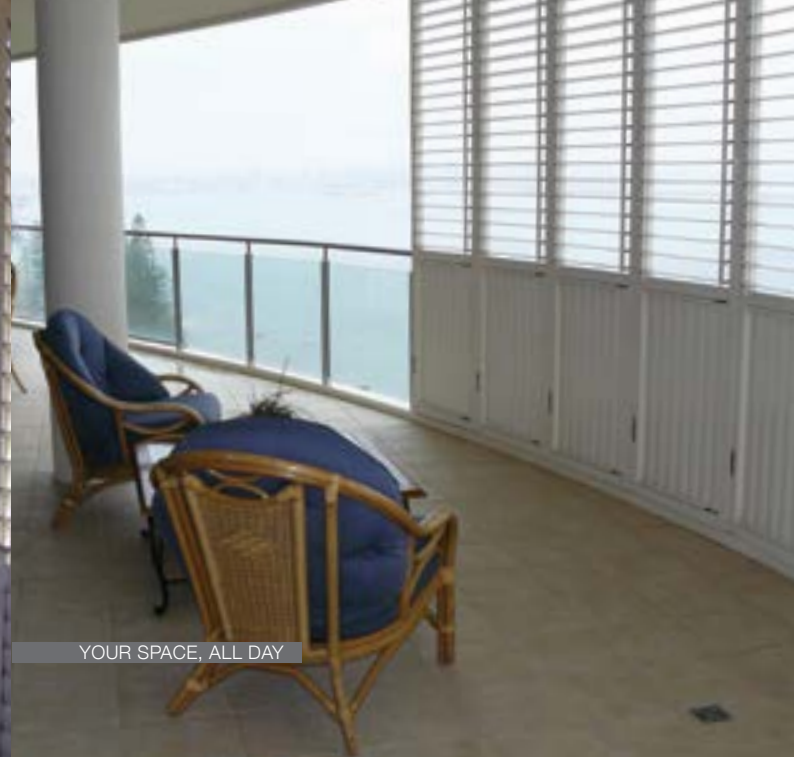
YOUR SPACE, ALL DAY